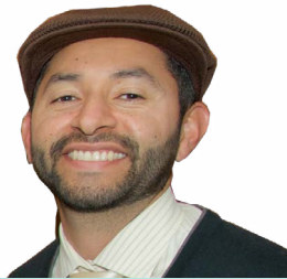
Educator and Community Activist Santa Maria High School